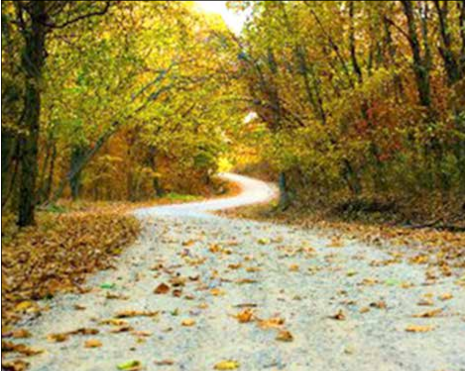
Our life is a journey.