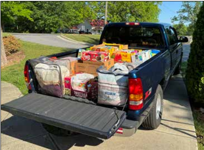
One of the truckloads on the way to the Raleigh Baptist Association for the Baptist Children's Home.