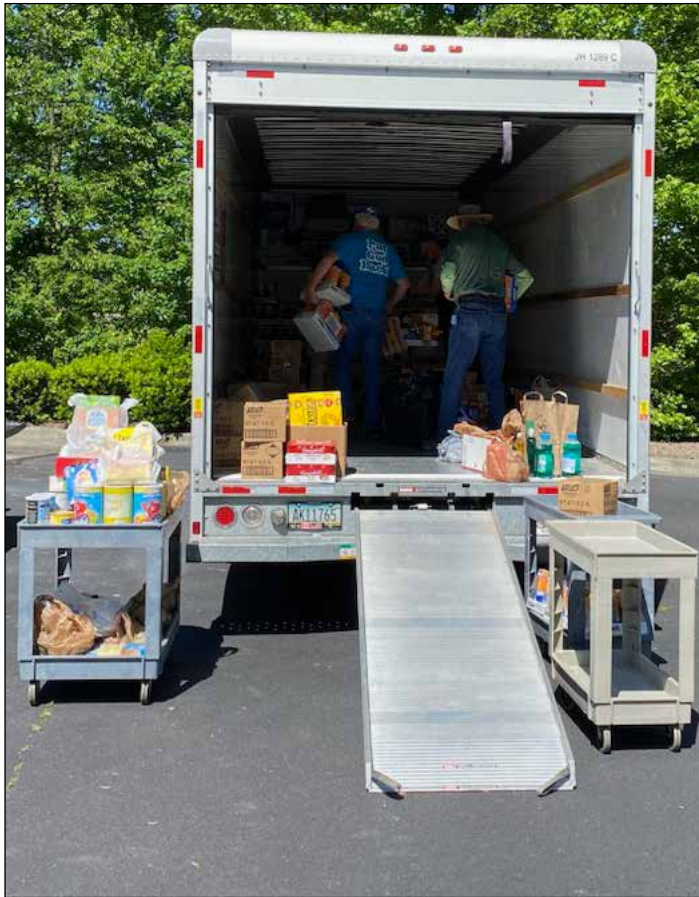
Volunteers at the Raleigh Baptist Association unloaded our trucks into their truck for transport to the Baptist Children's Home.