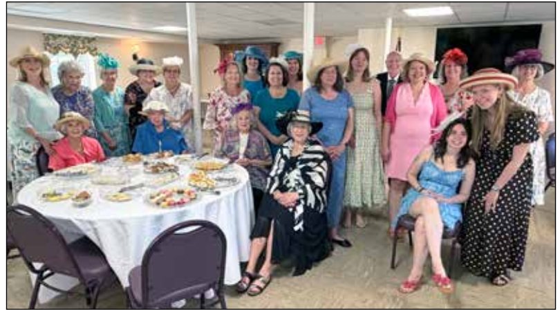
Our Ladies who attended our High Tea on May 17.