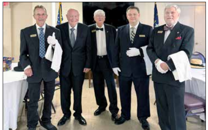
Our Deacons who hosted our Ladies High Tea on May 17.