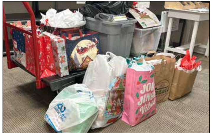
Our gift donations to our adopted family at Christmas.