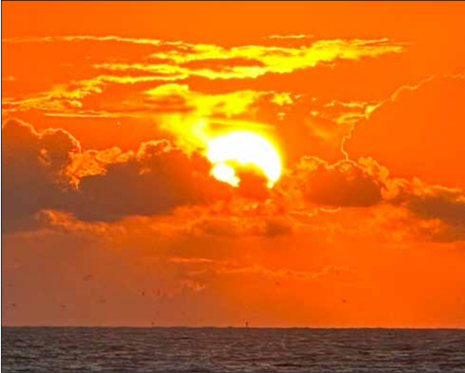
Sunrise at Jekyll Island, GA