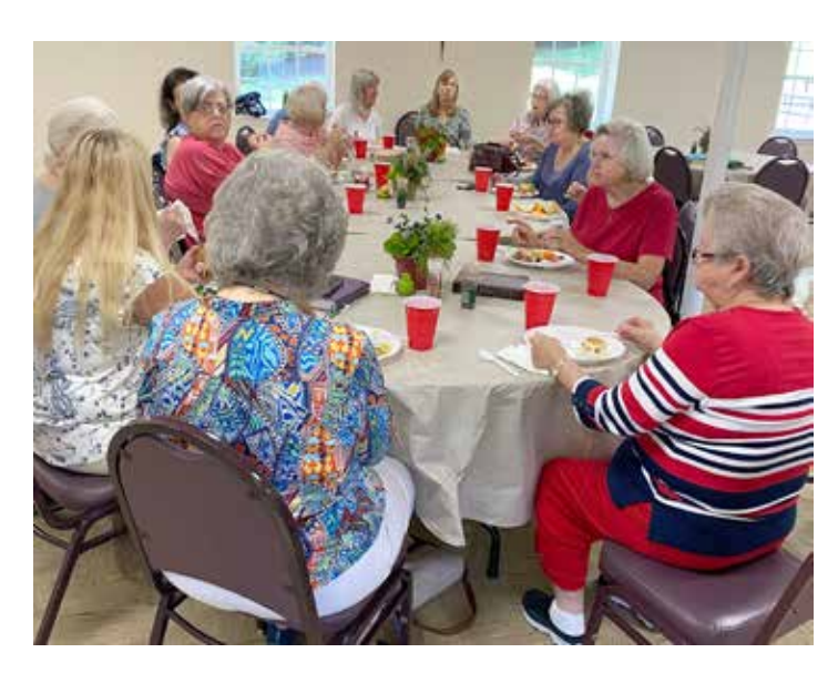
A scene from May's Ladies Luncheon.