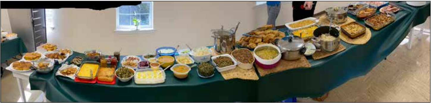
Just part of the spread of food enjoyed at our annual New Year's Day Luncheon. A large crowd enjoyed fellowship, desserts, and good wishes for a new year in addition to the above goodies.

population. I worked with a church in Eastern NC which had an impressive array of missions and ministries in their community. They had a vision, and they articulated it and lived it out in their community, but they were declining in attendance because the population of their community was declining. The pattern was for children to grow into adulthood and leave home because there were no jobs for them at home. The church was healthy, but its membership was in decline because the community around it was dying.